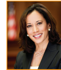
Kamala D. Harris California Attorney General